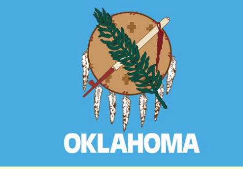
to be realized when rural and metro counties work together as a multi-county region to assess, design and implement plans that build on their assets and comparative economic strengths. That's what the Stronger Economies Together (SET) project is all about.

In many counties in Oklahoma – especially counties with smaller populations – finding ways to create, attract and retain jobs is a challenging process. Pursuing economic development as a single rural county in isolation from other nearby counties is becoming increasingly ineffective. In today's global market place, economic development progress is more likely