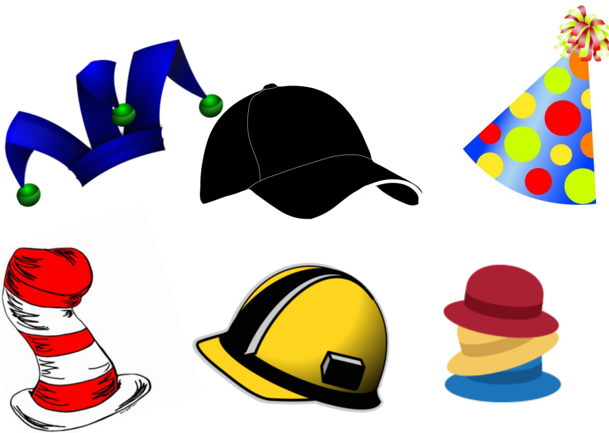
Many Hats of Middle Managers