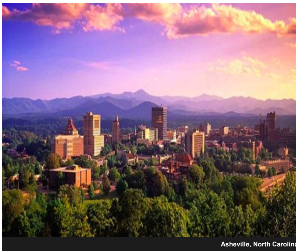
Asheville, North Carolina

Hearing about the winter storms and bad weather in much of the country, a little girl from the warm region asks: "Daddy, why don't we have snow here?" "Because it does not snow down here, Honey". "Hummm, she thinks, if we have no snow, can we build a snow man out of plants and branches?"