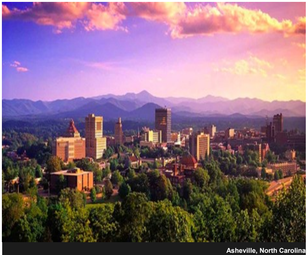
Asheville, North Carolina